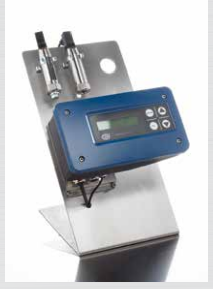
Pressure activated detection system