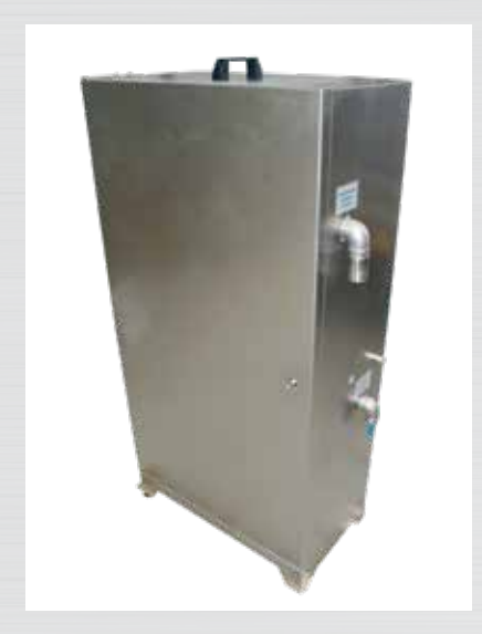
Oil separator, type: SEPP P1.