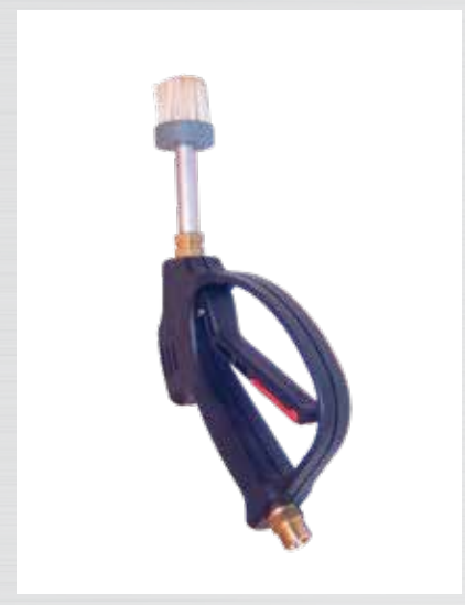
Manual washing gun.