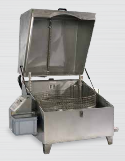
RT-series with fully opened cover provides easy access to the basket.