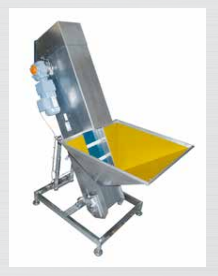
Hopper feed for small parts.