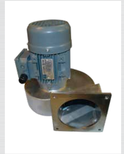
Extraction fan HL-14.