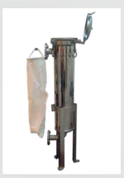
Type 2 - pressure filter

We can also provide a large selection of different cleaning solutions for use in our machines. Please contact us for advice on our various products - we will help you make the right choice.