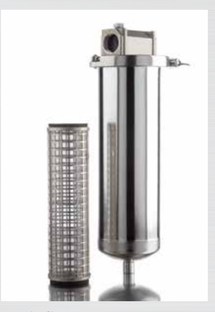
Cartridge filter 10"