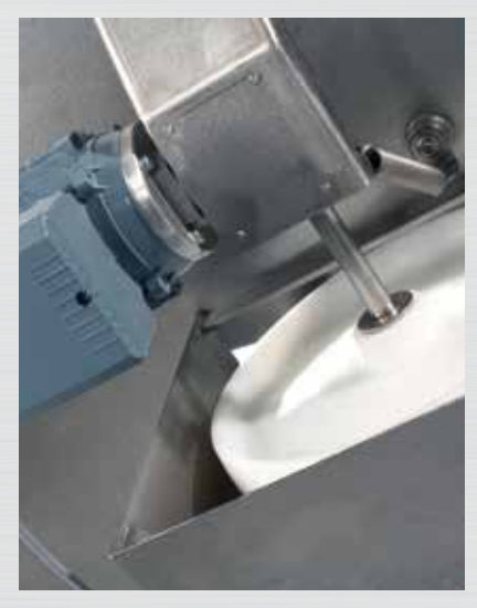
A motordrive can be fitted on the rotating basket of the toploader to ensure a positive rotation

Both the DT- and the RT-series have a simple control panel, from which the operator can adjust the wash cycle to suit the application.