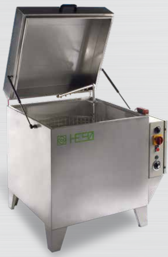
RT-series – simple and good value machine.